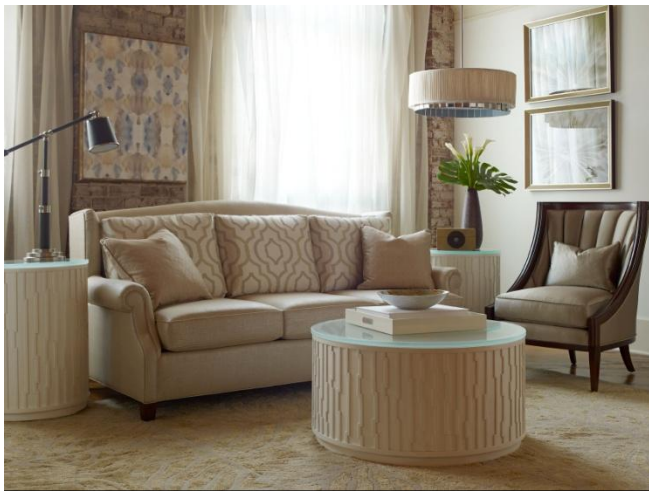
Most Candice Olson upholstery is available in a wide variety of fabrics and leathers