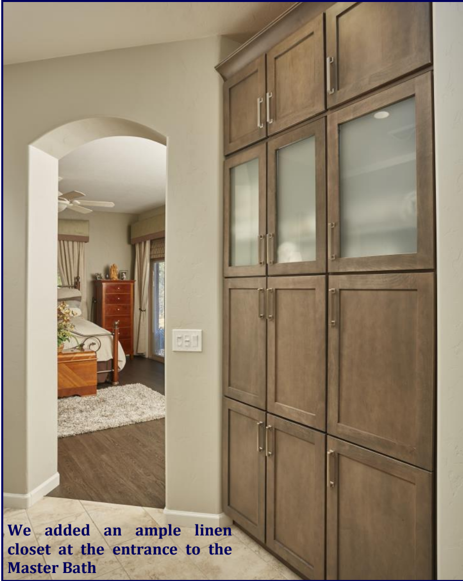
We added an ample linen closet at the entrance to the Master Bath