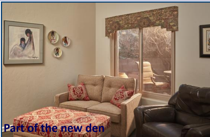
Part of the new den

The luxury vinyl tile (LVT) flooring in laundry is waterproof.