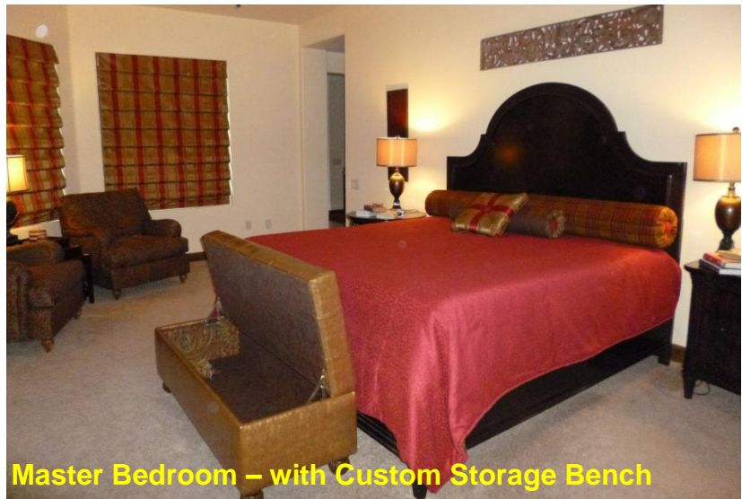
Master Bedroom – with Custom Storage Bench

The Roman Shades are a continuation of the theme establish in the dining room.