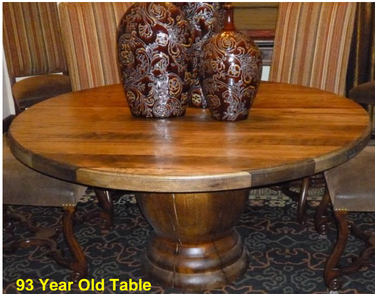
93 Year Old Table