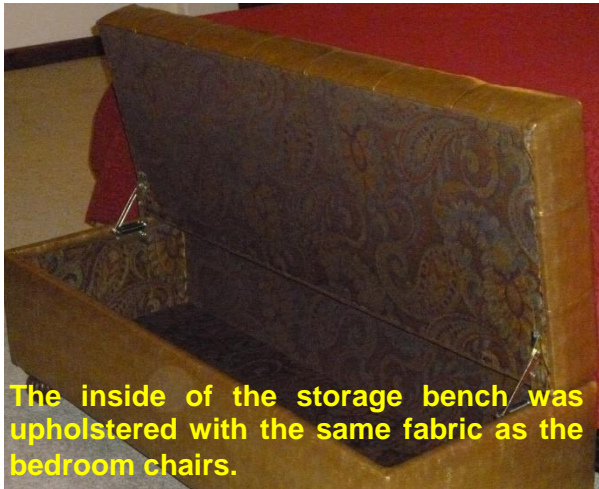
The inside of the storage bench was upholstered with the same fabric as the bedroom chairs.