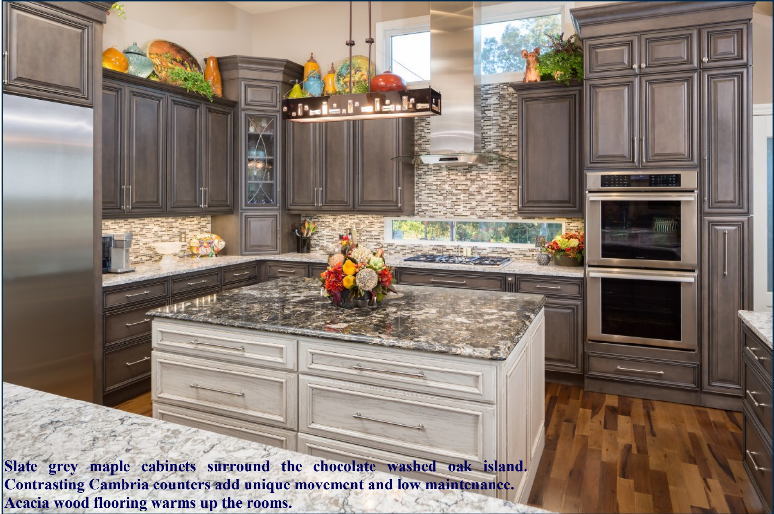
Slate grey maple cabinets surround the chocolate washed oak island. Contrasting Cambria counters add unique movement and low maintenance. Acacia wood flooring warms up the rooms.

Betty worked with the Pecks for weeks, going over every detail of what they wanted. She photographed and measured all furniture and drapes, including all items in cabinets. This was done to ensure everything in their new home would fit and look perfect. An example of the level of detail Betty put in to ensure the Peck's got exactly what they wanted.