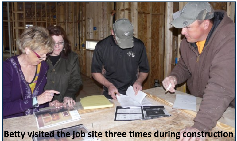
Betty visited the job site three times during construction