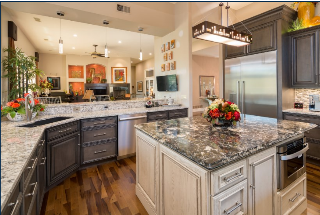
Open Floor Plan —The kitchen is open to the family room. Great for entertaining. Notice the under-counter drawer microwave in the island.