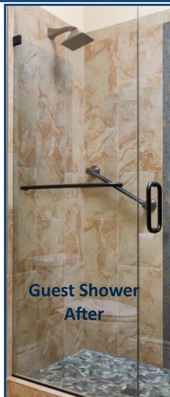
Guest Shower After