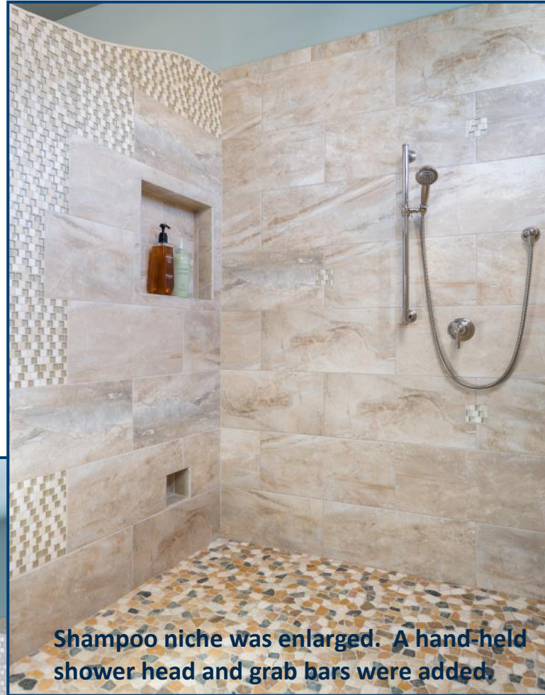
Shampoo niche was enlarged. A hand-held shower head and grab bars were added.

The main objective was to update both the master bathroom and the main guest bath their Air Force JAG lawyer son uses when he visits. Janice also wanted to make their master bath more functional for their retirement years.