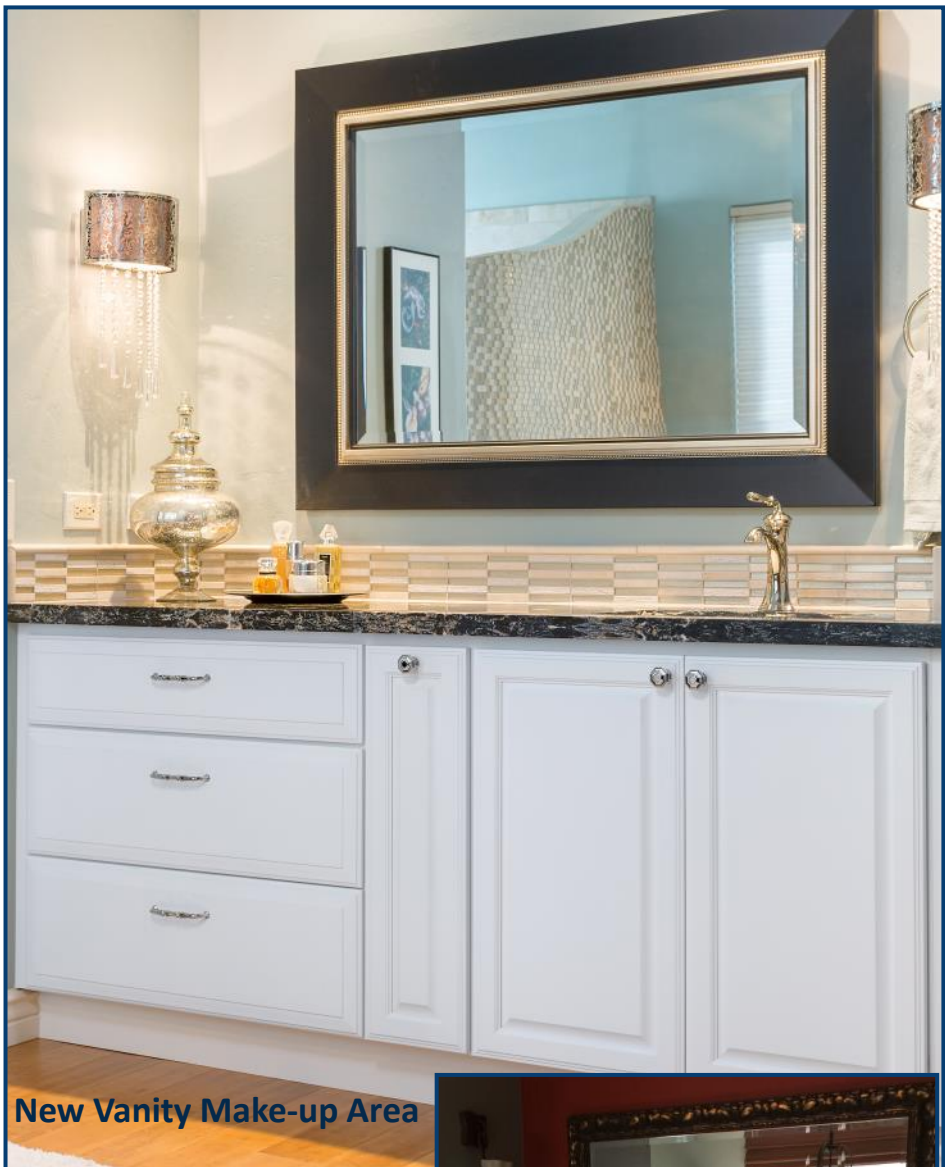
New Vanity Make-up Area