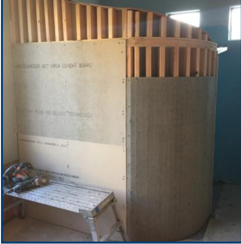
Waterfall Shower Wall Under Construction