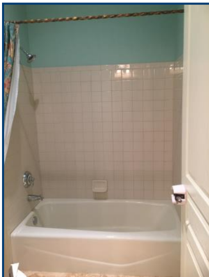
Guest Shower Before

New executive height cabinets, new backsplash, counter and updated sink and faucet completed this guest bath makeover.