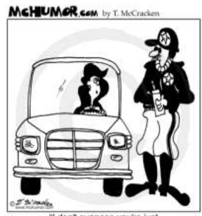
"I don't suppose you're just writing me a Valentine?"