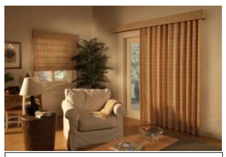
Averte Natural Fold – This versatile treatment can be used on a window like a drapery, on a patio door like a vertical blind or as a room divider. Since it is hand traversed, there are no cords to tangle or break.

Give us a call today for an appointment to see how Horizon Window Fashions can add beauty, privacy and light control to your home.