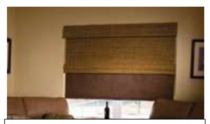
The Twin Shade – Combined in one unit, The Twin Shade is a fashionable Natural Woven Shade in the front with a practical Roller Shade in the back that acts as a movable lining.