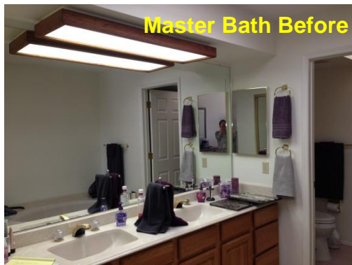
Master Bath Before