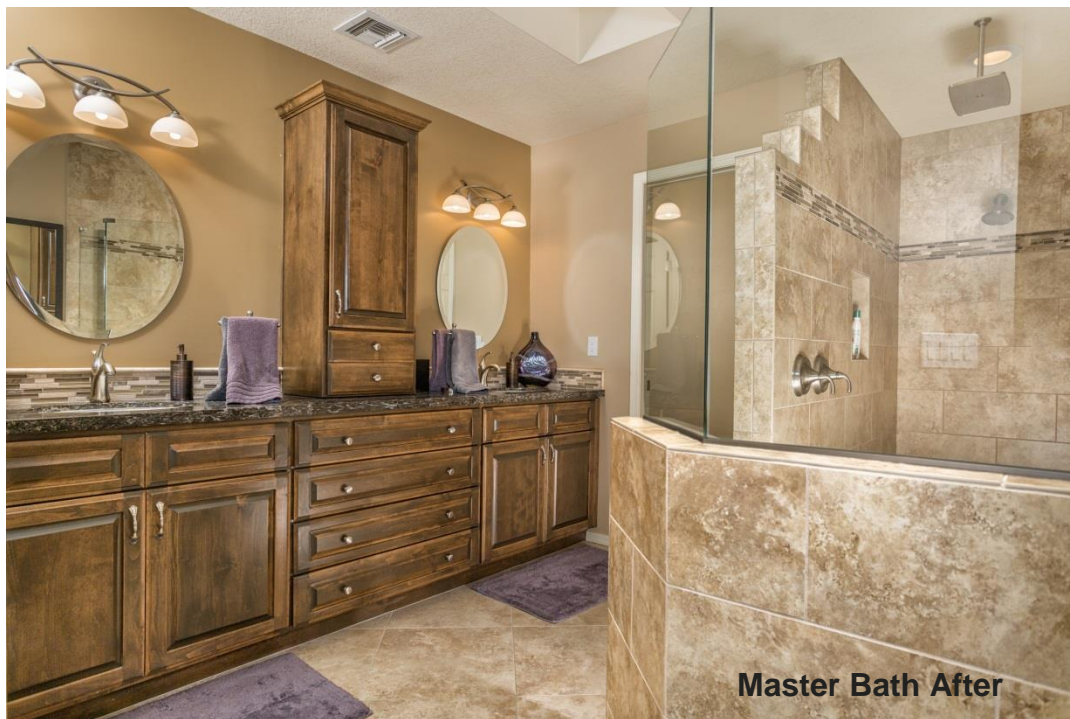
Master Bath After