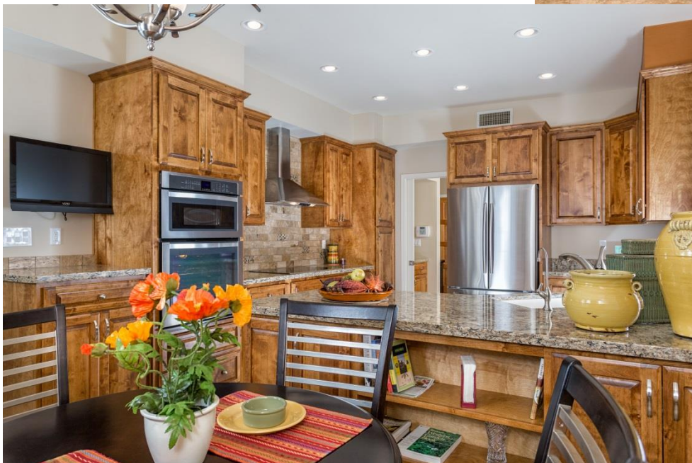
Total Kitchen Transformation