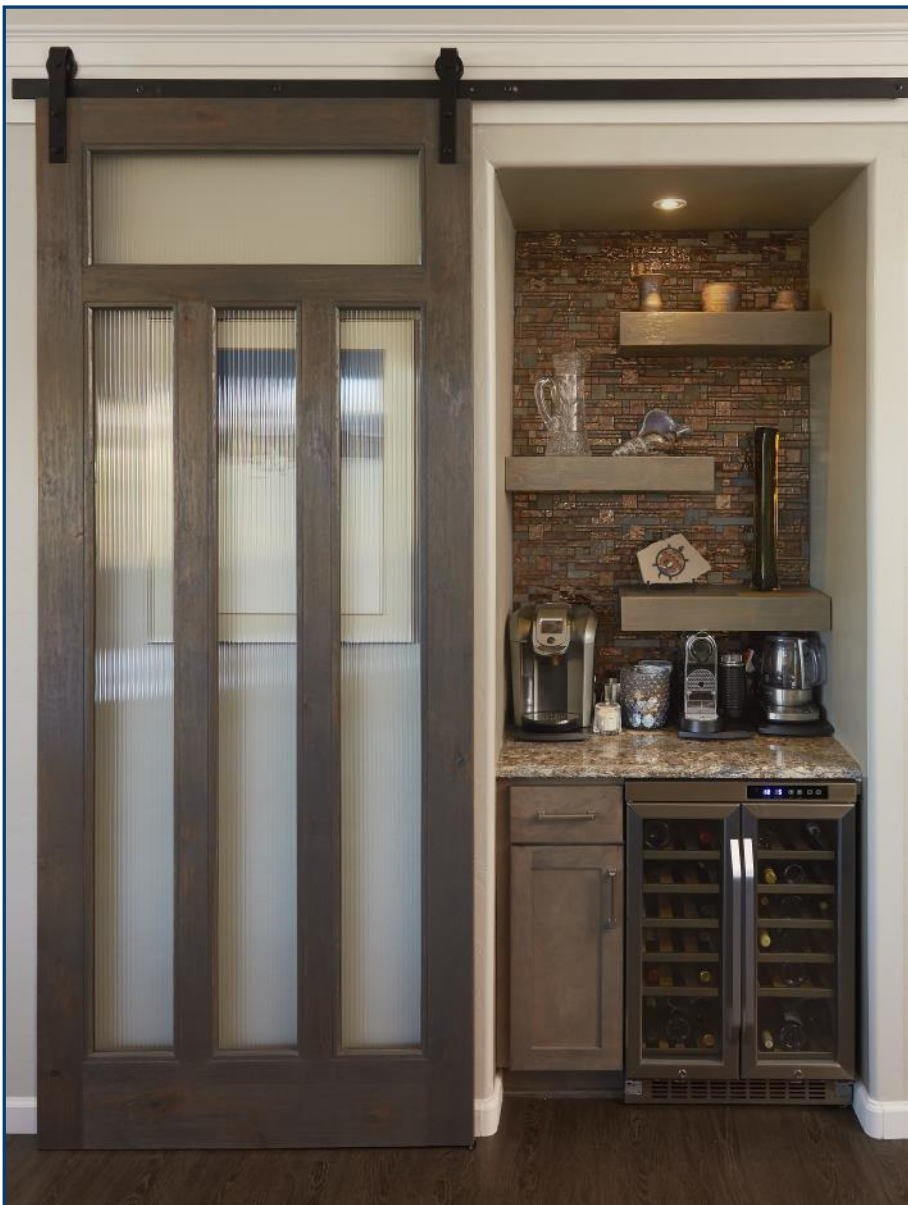
Custom Barn Door to hide the AM/PM Bar Special hardware to allow door to pass by artwork