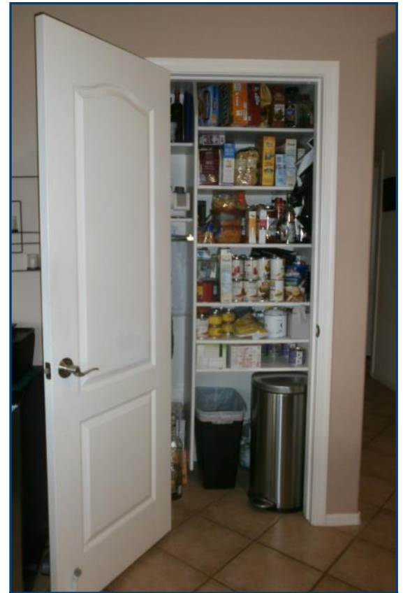
Pantry turned into AM/PM Bar