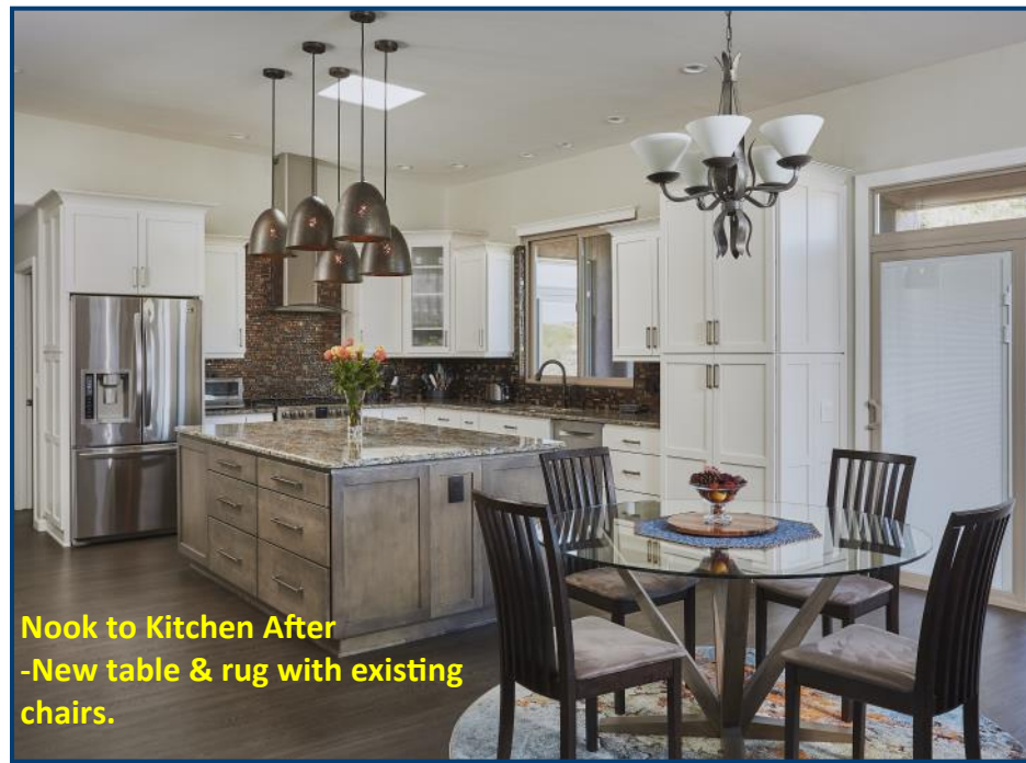
Nook to Kitchen After -New table & rug with existing chairs.