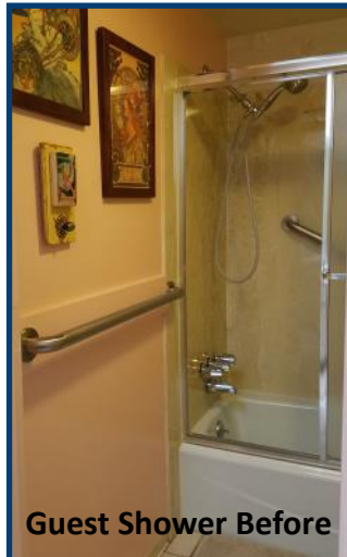
Guest Shower Before