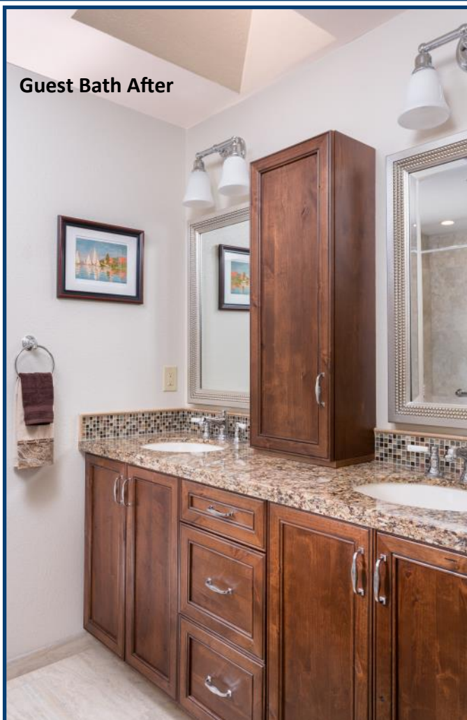
Guest Bath After

Linear drain used so the homeowners would not have to stand over the drain when showering.