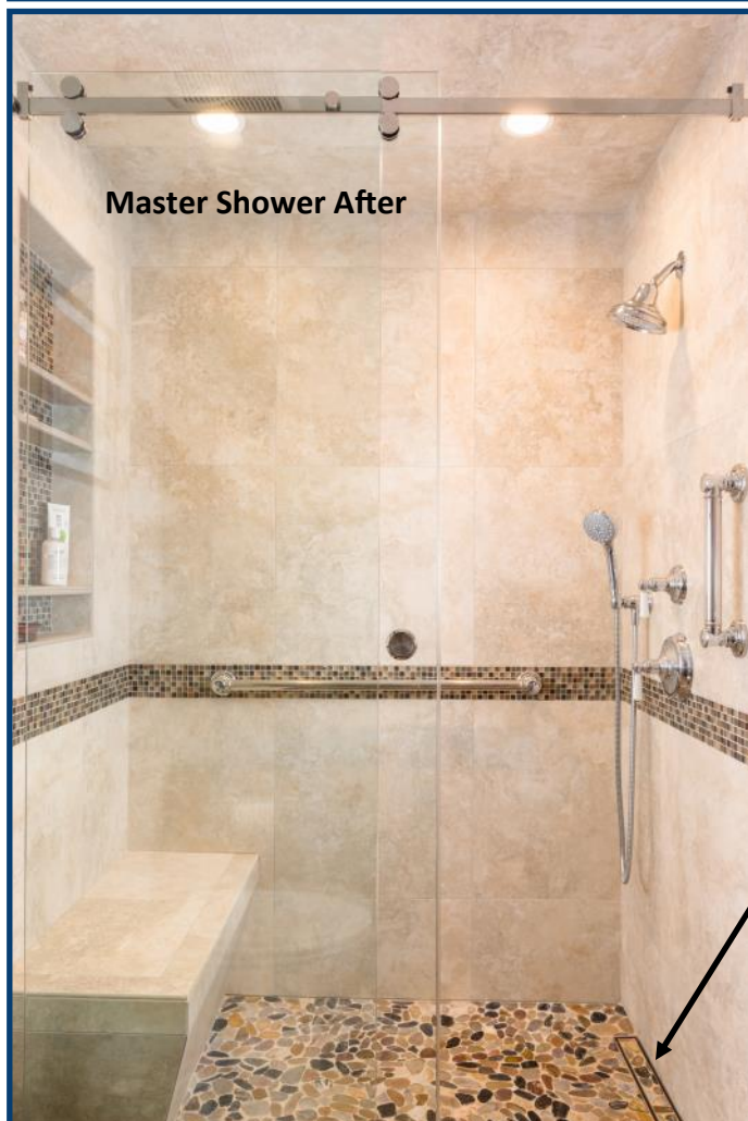
Master Shower After

"We looked around at several different places before deciding on Interior Expressions. They did everything we needed done to make our bathrooms beautiful and spectacular. Everyone that has seen them is envious of how the bathrooms turned out. Interior Expressions gave us the 'WOW' factor we wanted. They modernized the bathrooms without selecting a style that is too trendy and will quickly go out of style." Brenda & Chris Howitz, Tucson