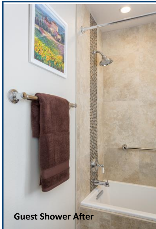
Guest Shower After