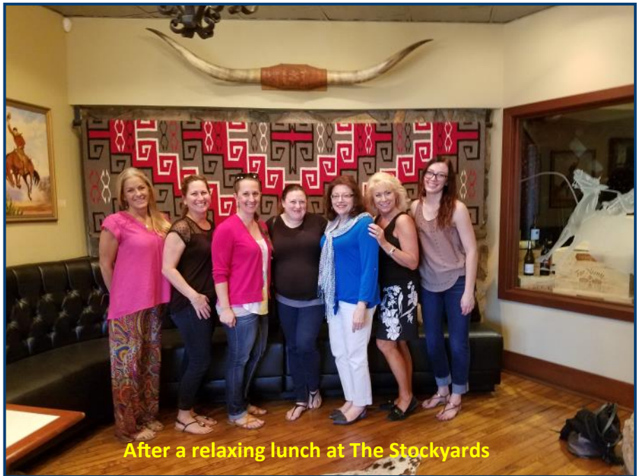
After a relaxing lunch at The Stockyards