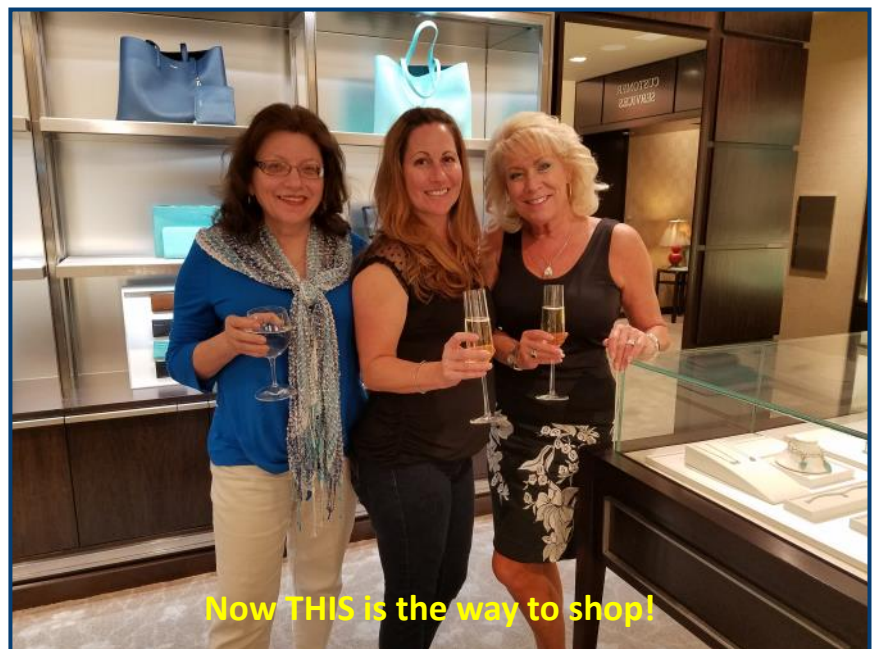
Now THIS is the way to shop!