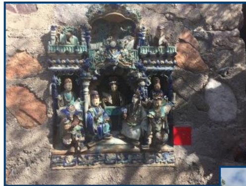
Unique artwork and sculptures throughout the property, some created by Wright himself.

If you haven't toured this special place, our entire team highly recommends it.