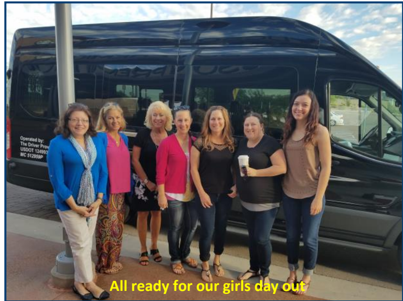
All ready for our girls day out