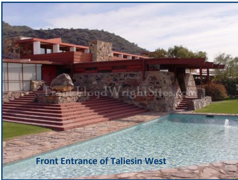
Front Entrance of Taliesin West

By 1932, Frank Lloyd Wright was not only growing tired of the harsh Wisconsin winters, he was also going broke.