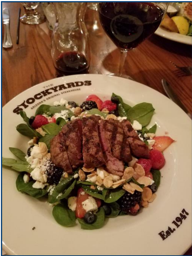
The Stockyards is known for their delicious beef, which the entire team would agree with.