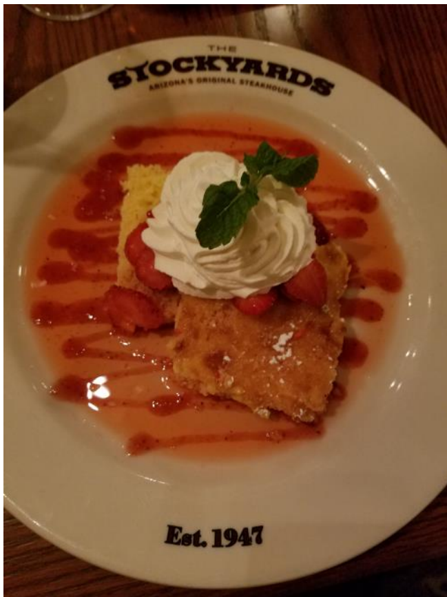
The deserts were wonderful too!