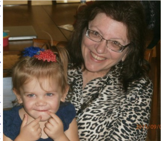
Enjoying a laugh with "the cutest granddaughter in the world".