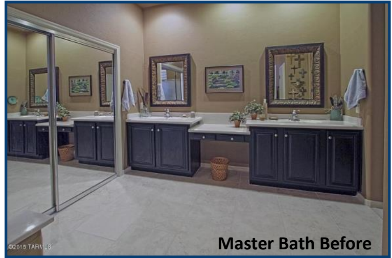
Master Bath Before