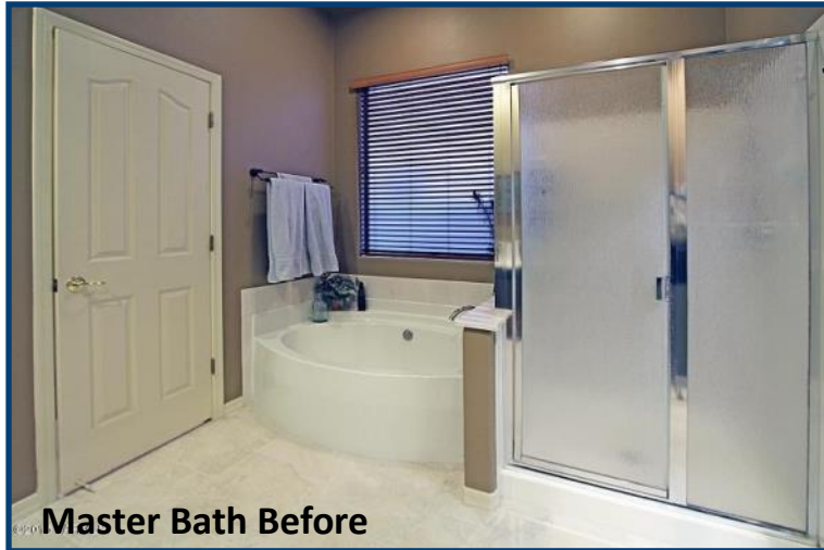
Master Bath Before