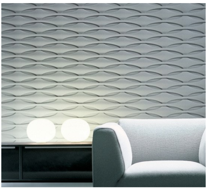
GYPSUM PANELS are one of the newest wall treatment options. They provide a cost-effective way to add a new and unique look for a wall or room. These panels can be painted to enhance your particular interior space.